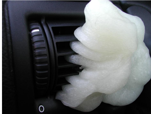
Pic. 2: Cleaning of the air inlet grill with Cyber Clean